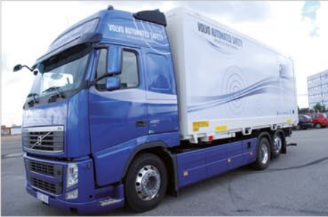
Automated queue assistance