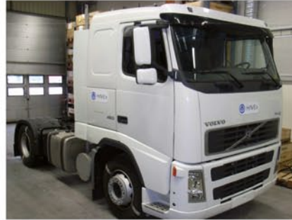
Brake by wire truck