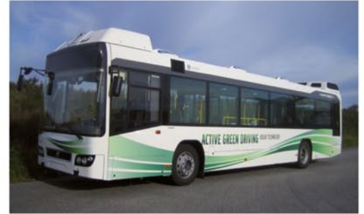
Active green driving