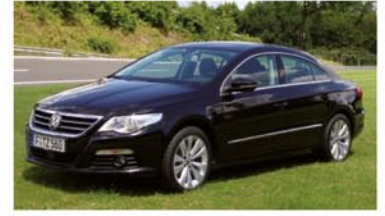
Automated assistance in roadworks